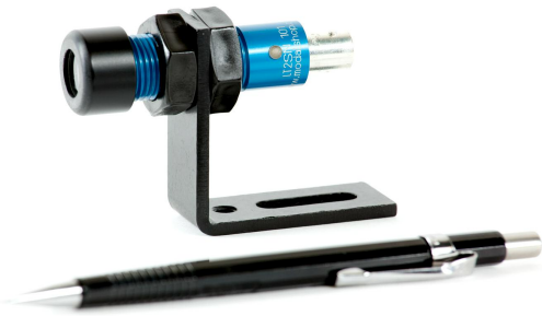
LaserTach LT2 shown with supplied mounting nuts

The LaserTach™ Model LT2 ICP® tachometer from The Modal Shop senses the speed of rotating equipment and outputs an analog voltage pulse train for referencing vibration signals to shaft speed. The sensor allows for measurements up to 100 000 RPM from distances as far as 20 in (51 cm). A status LED provides positive, visual indication of proper signal pickup. The standard BNC jack connects the sensor to all constant current, ICP conditioned data acquisition systems and signal conditioners. Unlike magnetic tachometer pickups, the LaserTach LT2 does not require the rotating equipment to be a ferrous material - only a retroreflective target needs to be attached to the shaft.